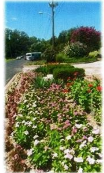
Location of Will Rogers Park

shelter, picnic tables and a stage. Recent renovations in the park have included a splash pad, new playground equipment, and now will be the home of the Teaching Gardens at Will Rogers Park.