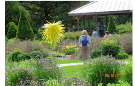
Jewell Botanical Garden in Skagway Alaska

The Deadline for August Newsletter Articles is Friday August 5, 2017