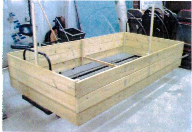
4 ft. x 8 ft. x 18"

Kits include assembly instructions, all lumber and hardware and are constructed of 5/4" X 6" treated decking material